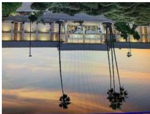
Oceanfront Hotel With Ocean Views From Every Room